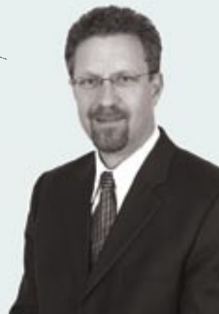
Chuck Strahl Minister of Agriculture and Agri-Food and Minister for the Canadian Wheat Board

I congratulate the IAF for its continued efforts to promote agriculture in British Columbia and look forward to working with you in the future.